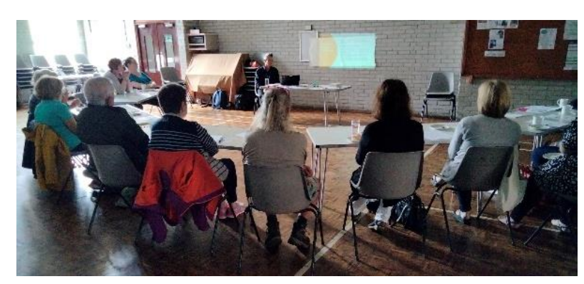
One of the forums held at a Christian Community Centre in Brixham

Healthwatch Torbay arranged a series of forums in liaison with local groups and services where people had an interest in adult social care and wanted to participate. An online virtual forum was also advertised for anyone who wished to participate but could not attend in person.